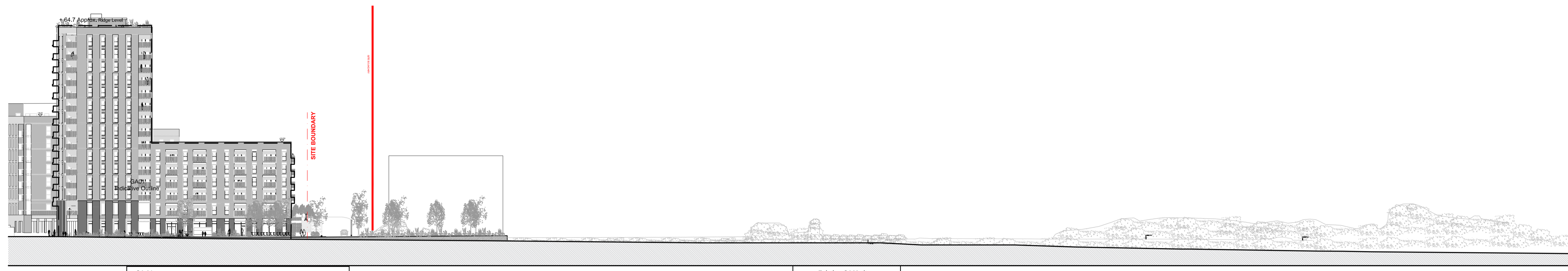
02 SITE ELEVATION B-B P0021 SCALE: 1:500